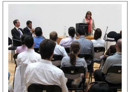
Chargé d'Affaires talks to U.S. students in Prague