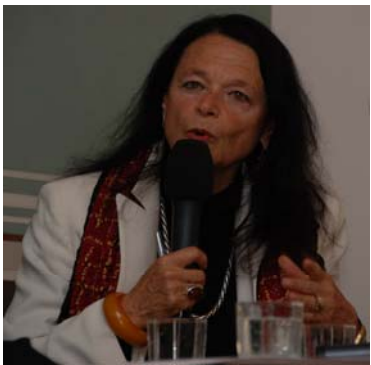
Anne Waldman

During the Prague Writers Festival, the American Center hosted two events with notable writers and cartoonists. On Wednesday June 10th three renowned poets discussed politics, identity and culture. Coming from very diverse regions and backgrounds, American Anne