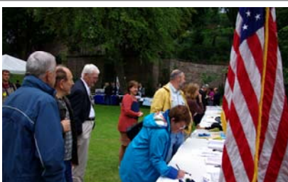
Open House party in the Embassy's garden

The Embassy opened its doors to Americans living in the Czech Republic on June 22, 2009 for the second annual American Citizens Open House. Embassy sections hosted informational tables in the Embassy garden alongside representatives from the Federal Benefits Units in