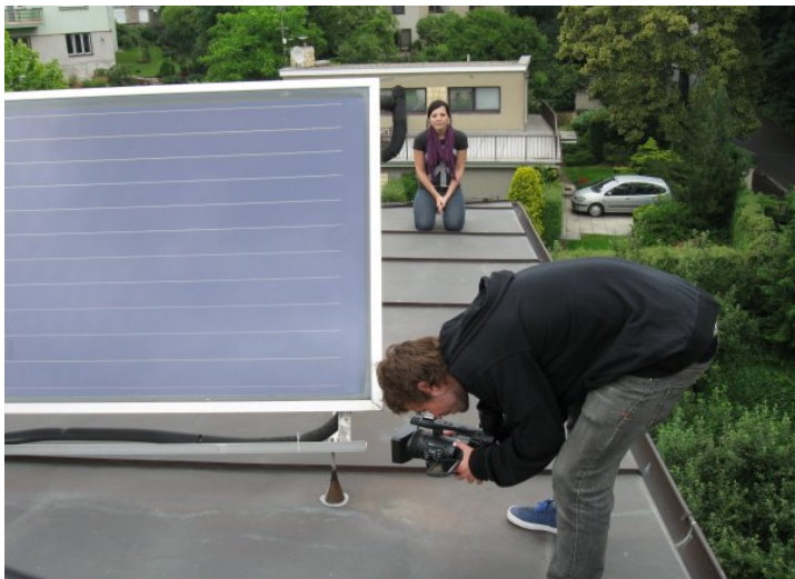
Students working on their solar energy story in Prague