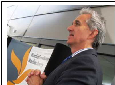
RFE President hails democracy's potential