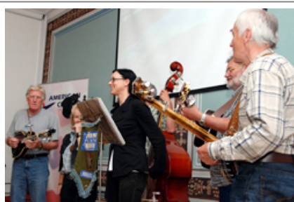
Country band Paberky playing at Wild West program

Before the busy summer tourist season, the U.S. Embassy's American Center in Prague featured on May 21 st "The Wild West without Visas". The program, designed especially for the younger adventure set, provided advice about using the Visa Waiver program to travel to the U.S., along with some traveler's recommendations about what to see while in America's