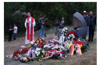
More people than ever came to honor Roma victims during WWII

On May 13, Political Councilor Charles Blaha attended the annual commemorative ceremony at the burial site of the former concentration camp for Roma in Lety. This year's event attracted a much larger number of citizens than ever before. There were some 250 people, including numerous Roma representatives, 160 high school students and numerous diplomatic representatives. Officials from the Czech government and parliament included Human Rights Minister Michael Kocab and former Foreign Minister Karel Schwarzenberg.