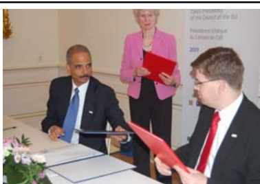
U.S. Attorney General Eric Holder and his Czech counterpart Jiri Pospisil exchange ratification documents