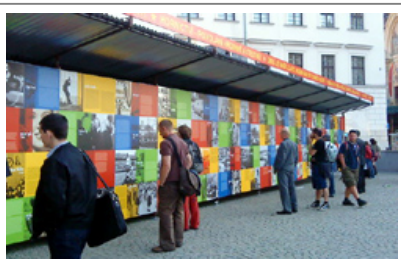
Outdoor exhibition "The Calendarium of Totality" on Náměstí Republiky in Prague

"The Calendarium of Totality," a U.S. Embassy-supported traveling outdoor exhibition opened on Náměstí