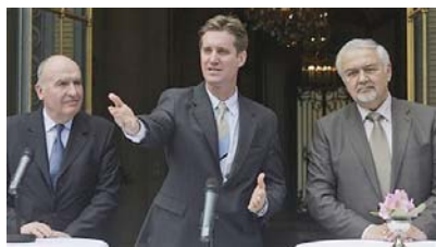
The OSCE Group Co-Chairs talk to journalist in U.S. Ambassador's residence

The OSCE Minsk Group organized a meeting of Azerbaijani President Ilham Aliyev and Armenian President Serzh Sargsian on May 7 at the U.S.