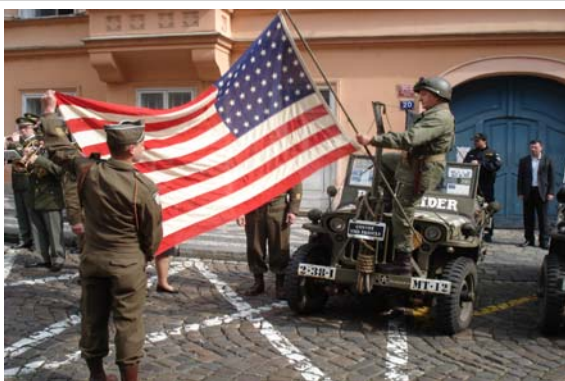
Members of Czech military club unfurl U.S. flag at U.S. Embassy