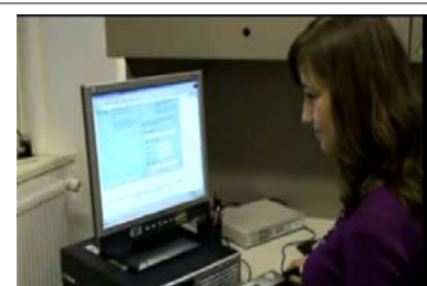
Navigating the ESTA website

For more than two months, Czechs have been able to travel to the U.S. without visas for business or tourism for as long as 90 days by using the Electronic System of Travel Authorization (ESTA). According to Consul General Stuart Hatcher, more than 6000 Czechs have applied for ESTA