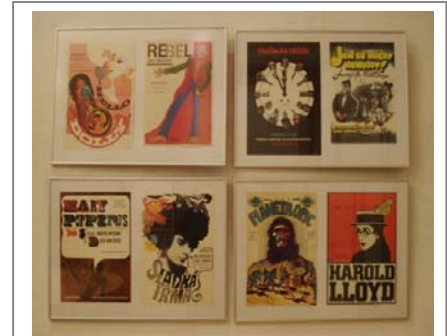
Czechoslovak movie posters in American Center

largely free to determine the posters' 'look'. An example of censorship can be found in the poster for Bezstarostný jezdec (Easy Rider), in which smoke obscures the American flag on Peter Fonda's back. The exhibition will be open until the end of March.