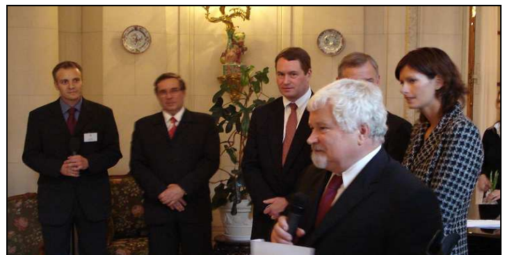
Senator Petr Pithart at the ceremony