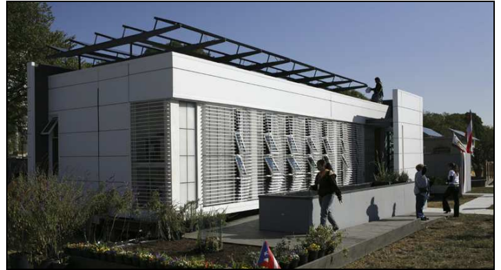
Czech Television reported on October’s Renewable Technologies Fair on the National Mall in Washington D.C.

A trade mission of six U.S. companies came to Prague on September 17 to share with Czech counterparts the latest developments in renewable energy know how and to find new business partners. About 12 Czech firms and representatives of the Ministry of Agriculture and Czech Energy Agency attended the meeting in the American Center. Couple of days later, Plymouth Tube Company representatives signed a contract with a Czech firm doing business in energy that could eventually become Plymouth’s distributor.