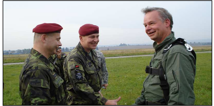
Ambassador greets Czech soldiers after his jump in Prostějov

the town of Jičín, called “The City of Fairytales.” There he spoke with high school students about opportunities to study in the United States, toured the historic town square built by Albrecht of Valdstejn as well as a Czech-American dental company operating in Jičín.