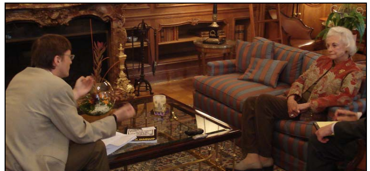
Justice O’Connor talks to a reporter from Hospodářské noviny