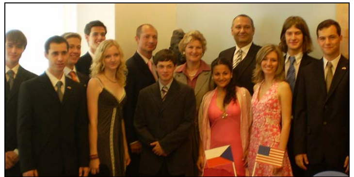
Hughes with Junior Ambassadors at the American Center, Pilsen

Under Secretary of State for Public Diplomacy Karen Hughes was in Prague June 11-13 to attend an annual meeting of the Broadcasting Board of Governors, which oversees the work of RFE/RL. Hughes also traveled to Pilsen, where she met with participants of the Junior Ambassador program and visited the Pilsner Urquell brewery. In an interview with Lidove noviny , she talked about the U.S. role in the world, “waging peace” to counter terrorist ideology, and the importance of freedom and democracy as underscored by President Bush.