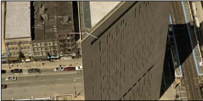
A work from the Revealing Chicago exhibition, in Prague through August 19

Did you know that Chicago is Prague’s Sister City in the United States? The Clam-Gallas Palace in downtown Prague is now hosting an Embassy-sponsored exhibition of 63 aerial photographs entitled “Revealing Chicago,” which portrays the urban, suburban and rural environments of America’s largest Midwestern city. Photographer Terry Evans produced the series of photographs to capture the city’s growth, its use of open space and its unique neighborhoods, transportation systems, industrial zones and parks. It also depicts the challenges facing cities like Chicago and Prague, along with some potential solutions. More at http://www.revealingchicago.org/