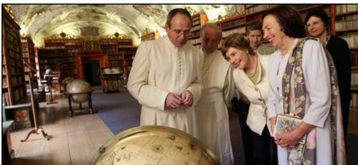
First Ladies Laura Bush and Livia Klausová at the Strahov Monastery

President George W. Bush and First Lady Laura Bush visited the Czech Republic on June 4 – 5. Prague marked the first stop on his European tour, which included the G8 summit in Heiligendamm, Germany, Poland, Italy, Albania and Bulgaria. Bush met with Czech President Vaclav Klaus, Prime Minister Mirek Topolánek and other Czech leaders. Missile defense and visa issues dominated bilateral discussions. Speaking at a conference on security and democracy, the President underscored America’s deep appreciation for the brave efforts of political dissidents around the world in pressing for greater freedom.