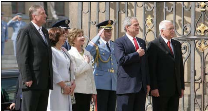
The official arrival ceremony for President Bush at the Prague Castle

“Freedom is the best way to unleash the creativity and economic potential of a nation. Freedom is the only ordering of a society that leads to justice. And human freedom is the only way to achieve human rights.... The most powerful weapon in the struggle against extremism is not bullets or bombs -- it is the universal appeal of freedom. Freedom is the design of our Maker, and the longing of every soul.” (President Bush, speaking in Prague June 5)