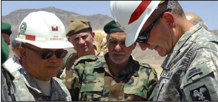
General Eikenberry in Afghanistan, right, looks at the plans for the construction of an Afghan National Army Regional Brigade facility

Commander of the Combined Forces Command-Afghanistan, Lieutenant General Karl Eikenberry, visited Prague on January 23 to express his appreciation for the Czech decision to send a field hospital to Kabul and praise the professionalism of the Czech forces in Afghanistan. Defense Minister Vlasta Parkanova awarded General Eikenberry the prestigious Czech Meritorious Cross, a gesture which he said greatly touched him. The Czech Republic has currently about 150 troops in northeastern Afghanistan and in Kabul.