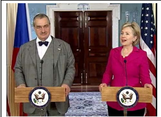
U.S. State Secretary Hillary Clinton and her Czech counterpart Karel Schwarzenberg in Washington on February 10.

In a press conference with Czech Foreign Minister Karel Schwarzenberg in Washington on February 10, U.S. Secretary of State Hillary Clinton thanked the Czech Republic for its role in NATO's Afghanistan mission while reaffirming the U.S. government's commitment to the security of the U.S. and its allies. Speaking about the proposed missile-defense system in the Czech Republic and Poland, Secretary Clinton noted that numerous considerations, predominantly technical, were part of the ongoing missile-defense dialogue. In a reference to Iran, Secretary Clinton noted that a willingness on the Iranian government's part to abandon its pursuit of nuclear weapons would also be factored into the equation. "We had a very good discussion about our hopes to work together – the European Union and the United States – in dissuading the Iranians from pursuing nuclear weapons. But if the Iranians continue on this path, certainly one of the options for free countries like the Czech Republic, other Europeans, and the United States, is to defend ourselves. So this is one of those issues that really will rest with the decisions made by the Iranian Government." While sounding a hopeful note about dialogue with Iran's government, Secretary Clinton recognized that defensive measures were important. "Our slogan can be 'hope for the best, but plan for the worst,'" she concluded, "I think that's a realistic approach."