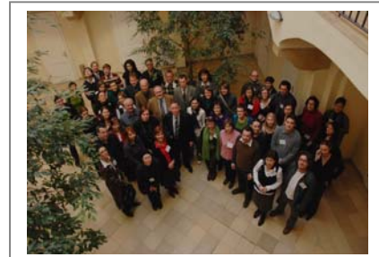
Master class participants in American Center